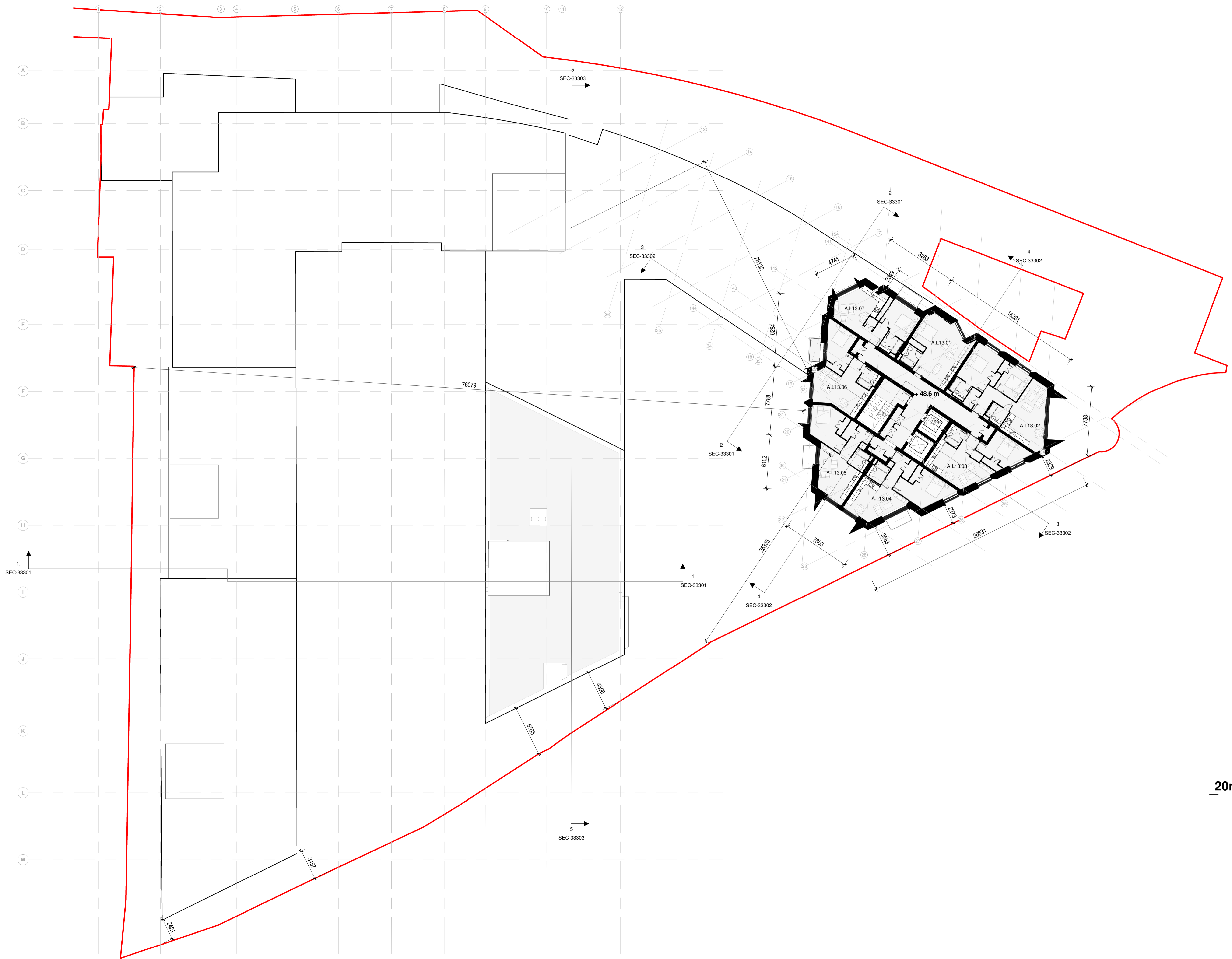
Proposed 13th - 24th Floor Plan 1 : 200

Notes: DO NOT SCALE FROM THIS DRAWING. USE FIGURED DIMENSIONS IN ALL CASES. VERIFY DIMENSIONS ON SITE AND REPORT ANY DISCREPANCIES TO THE ARCHITECTS IMMEDIATELY. THIS DRAWING TO BE READ IN CONJUNCTION WITH THE ARCHITECTS SPECIFICATION. © THIS DRAWING IS COPYRIGHT AND MAY ONLY BE REPRODUCED WITH THE ARCHITECTS PERMISSION. OSI License Number - AR 0052219 Projection / Spatial Reference: Projection: IRENE196_msh_Transverse_Mercator Centre Point Coordinates: X,Y= 713657.3699,734403.2446 Reference Index: Map Series / Map Sheets 1:1,000 | 3263-02 1:1,000 | 3263-08 1:1,000 | 3263-07 1:1,000 | 3263-03 Vertical Datum: MALIN HEAD